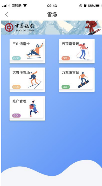
Bank of China Official App

Visitors who want this common ski pass for the three ski areas can simply select