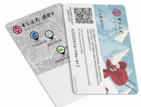
Smart Card TRW FULL

In order to offer guests a comfortable experience, the ski resorts were equipped or extended with innovative products and access solutions from Axess. Among others Axess CONTROLLER 600, AX500 Smart Gates NG, TVM (Ticket Vending