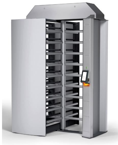
Axess Smart Security Gate

In addition, 4 AX500 Smart Security Gates were installed by our team in Finland. The robust, vandalism-proof construction fulfils the highest security fea-