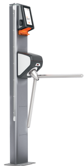
Axess Smart Gate NG Turnstile