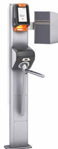
Axess Smart Gate NG mit BADGE BOX 600

between the gates and the data center takes place wirelessly within the WiFi area. With the latest Axess update, BERNEXPO is perfectly equipped for the largest event "BEA" in spring 2022 with over 290,000 visitors.