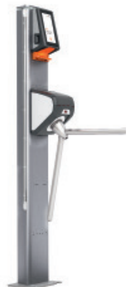
Axess Smart Gate NG

From now on, La Mure station will be equipped with several Axess Smart Gates , including an ADA access for special needs with a wider entry. In addition,