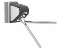
Turnstile Panic Asymmetric