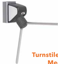
Turnstile Panic Mechanic