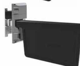
Flap Paddle ADA